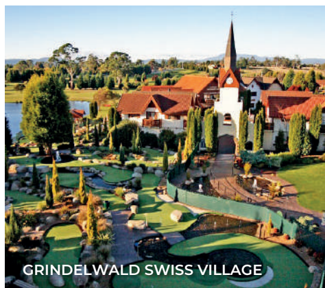
GRINDELWALD SWISS VILLAGE